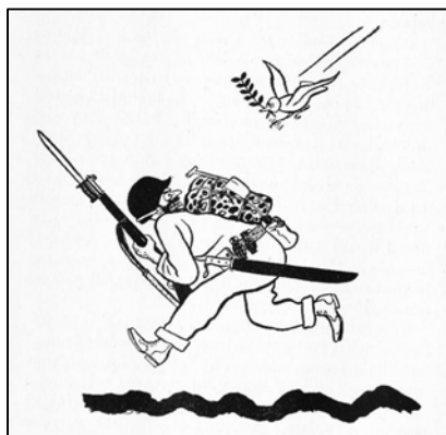
Fig. 1. Depiction of WWII Veteran Readjustment Problems. 225

The civilian community's experiences with returning veterans and their problems underscored the necessity of developing innovative programs to address their crimes. 226 As the military was the very origin of many combat neuroses, the Armed Forces had an even more pressing need to become efficient in both the practice of psychiatry and the practice of military justice in relation to psychiatric conditions. The Service Command Rehabilitation Center (SCRC) was the first real bridge between these distinct areas.