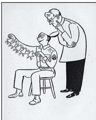
Fig. 2. Depiction of the Effects of Rapid Psychiatric Growth. 295

both the prevalence of psychiatric analysis in the Army and the stigma that accompanied it: