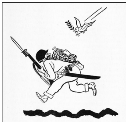
Fig. 1. Depiction of WWII Veteran Readjustment Problems. 225

The civilian community's experiences with returning veterans and their problems underscored the necessity of developing innovative programs to address their crimes. 226 As the military was the very origin of many combat neuroses, the Armed Forces had an even more pressing need to become efficient in both the practice of psychiatry and the practice of military justice in relation to psychiatric conditions. The Service Command Rehabilitation Center (SCRC) was the first real bridge between these distinct areas.