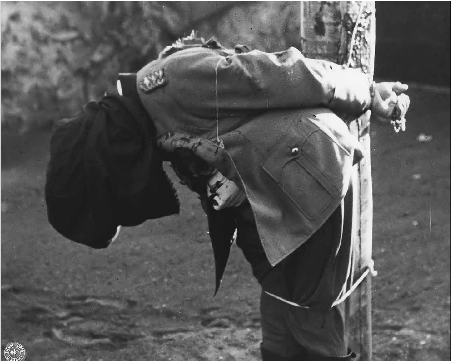
Dostler's lifeless body slumps from a pole after his execution by firing squad.

Dostler took the stand and, under oath, testified that he had no choice when it came to ordering the execution of the members of the Ginny mission: They had been caught while carrying out a commando-type mission and his oath to Hitler required him to obey the Fuhrerbefehl of October 1942, even if that order violated international law. 20