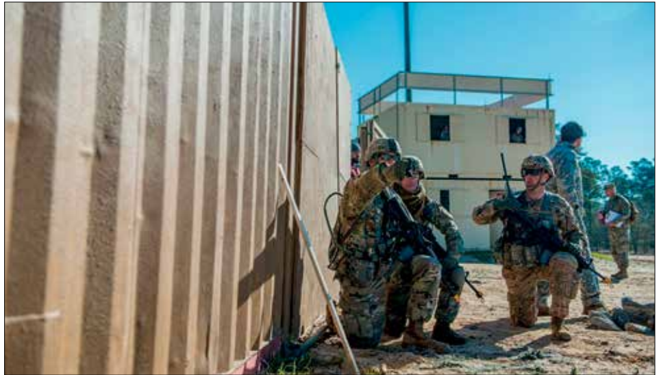
Members of the 1st Security Force Assistance Brigade train at Fort Polk, Louisiana prior to their deployment to Afghanistan.

This assignment has been professionally and intellectually challenging. When you are building an airplane in flight, every single day can make you feel like you are crash