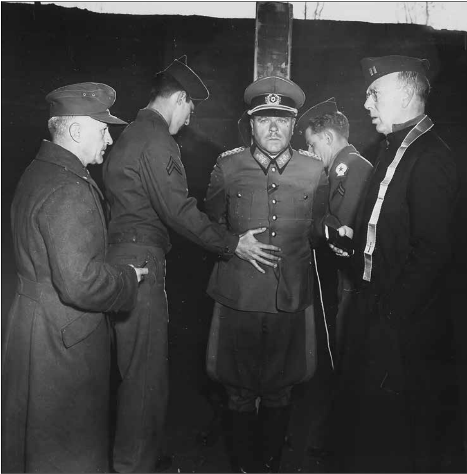
German General Anton Dostler is tied to a beam shortly before his execution.