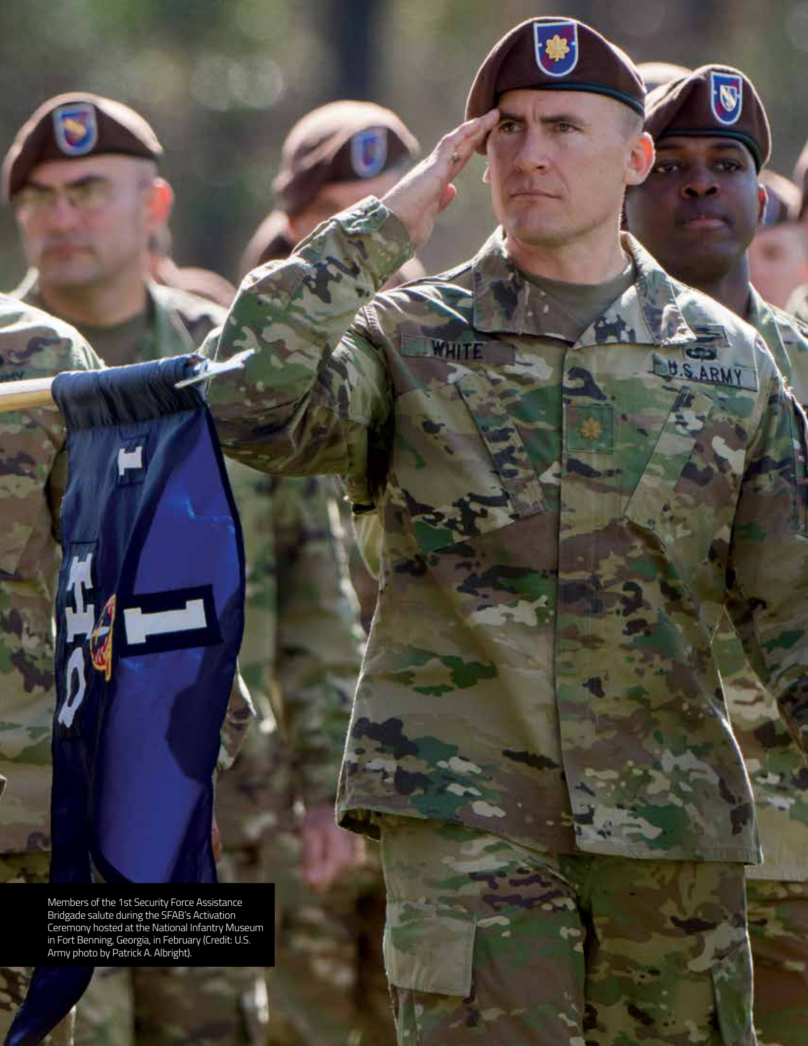
Members of the 1st Security Force Assistance Brigade salute during the SFAB's Activation Ceremony hosted at the National Infantry Museum in Fort Benning, Georgia, in February.