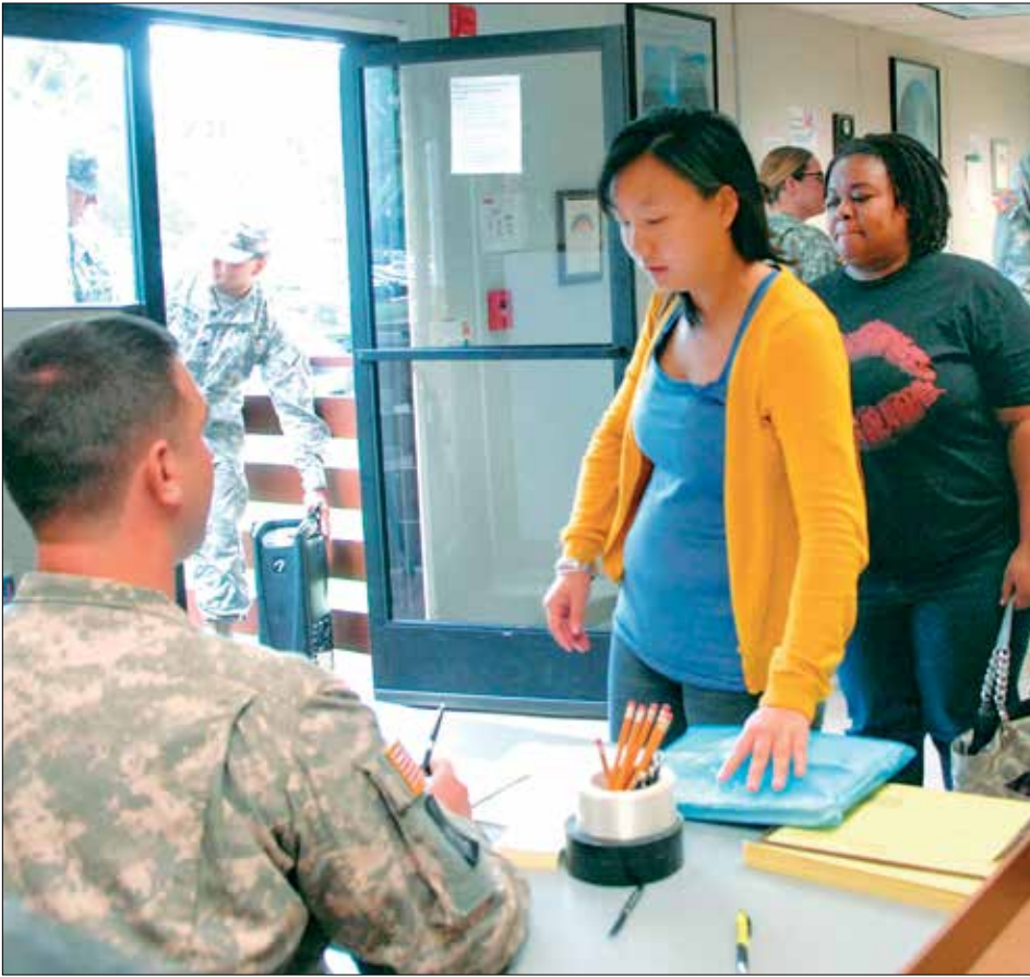
The Schofield Barracks Tax Center, pictured left, closed after leadership at the U.S. Army Garrison-Hawaii determined the number of free or low cost tax sites available to service members, retirees, and families outweighed the cost of having Soldiers run the center as volunteers.