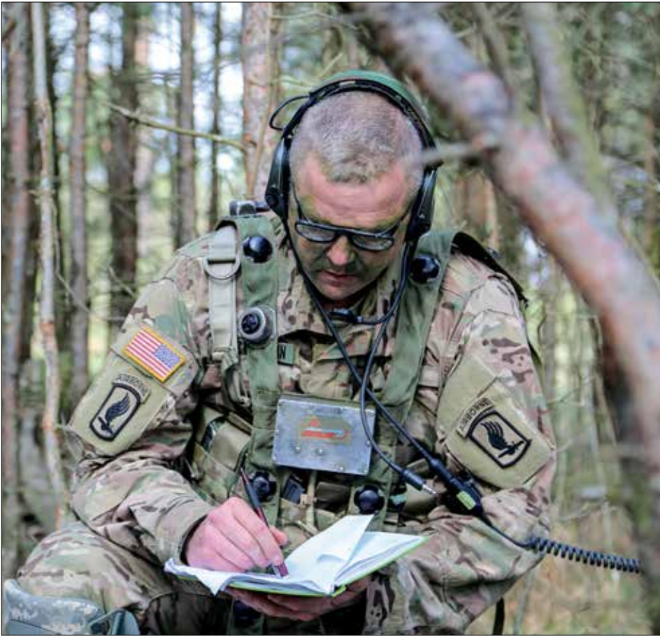
A U.S. Soldier of the 173rd Airborne Brigade writes coordinates while conducting a pre-missions brief during exercise Saber Junction 16 at the U.S. Army's Joint Multinational Readiness Center (JMRC) in Hohenfels, Germany.