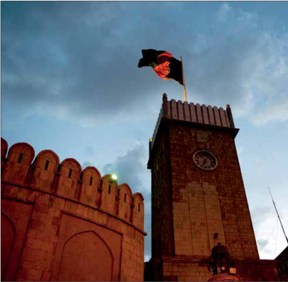
The Afghan flag flies over the entrance to the presidential palace in Kabul, Afghanistan.