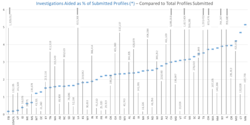
Figure 2: U.S. Military (USACIL) DNA Submissions Have Been Among the Least Effective in Aiding Investigations (based on Oct 2020 NDIS statistics).