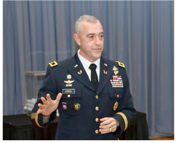
RIGHT: MG Tom Ayres, The Deputy Judge Advocate General, addresses the Basic Course during Graduation. BELOW: Officers of the 194th JAOBC are sworn in as Judge Advocates.

o mission is more important to the effectiveness of The Judge Advocate General's Corps than preparing new officers to serve as Judge Advocates. The ten and onehalf weeks of the Basic Course prepare these oficers to be effective Soldier-Lawyers. The course is also the mechanism by which The Judge Advocate General certifies counsel for practice under Article 27(a) of the Uniform Code of Military Justice.