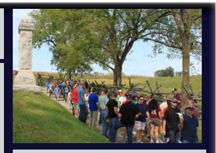
ABOVE: Student briefings being conducted in "The Bloody Lane" at Antietam National Battlefield. BE-LOW: Class photo of the 63d Graduate Class at the New York Monument, Antietam Battlefield.

Each year one of the highlights of the Graduate Course are the staff rides to Antietam and Gettysburg. The battles form the backdrop for key lessons in leadership for the students as they prepare to become field grade officers. The trips are also key class bonding events, solidifying ties among the key future leaders of the JAGC.